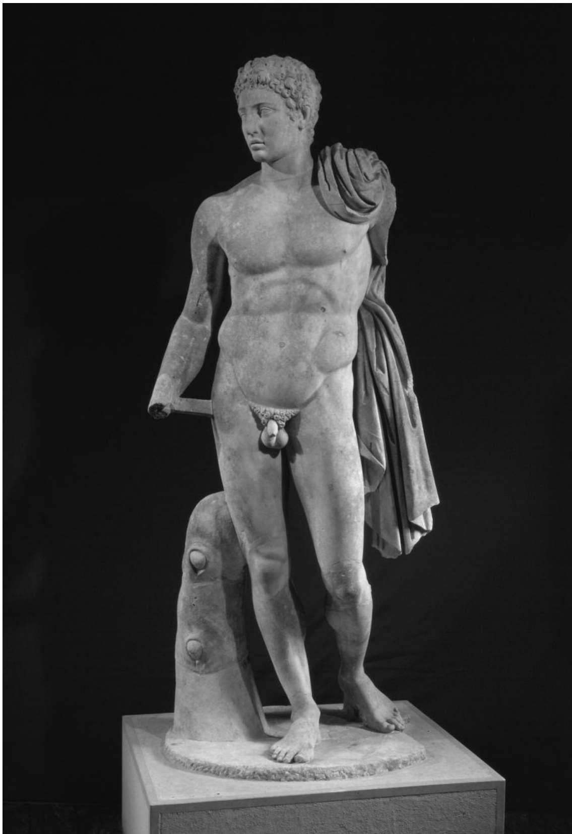
Fig. 5. Statue of heroized dead youth as Diomedes in Thasian marble. From Messene. Messene Museum 8664.