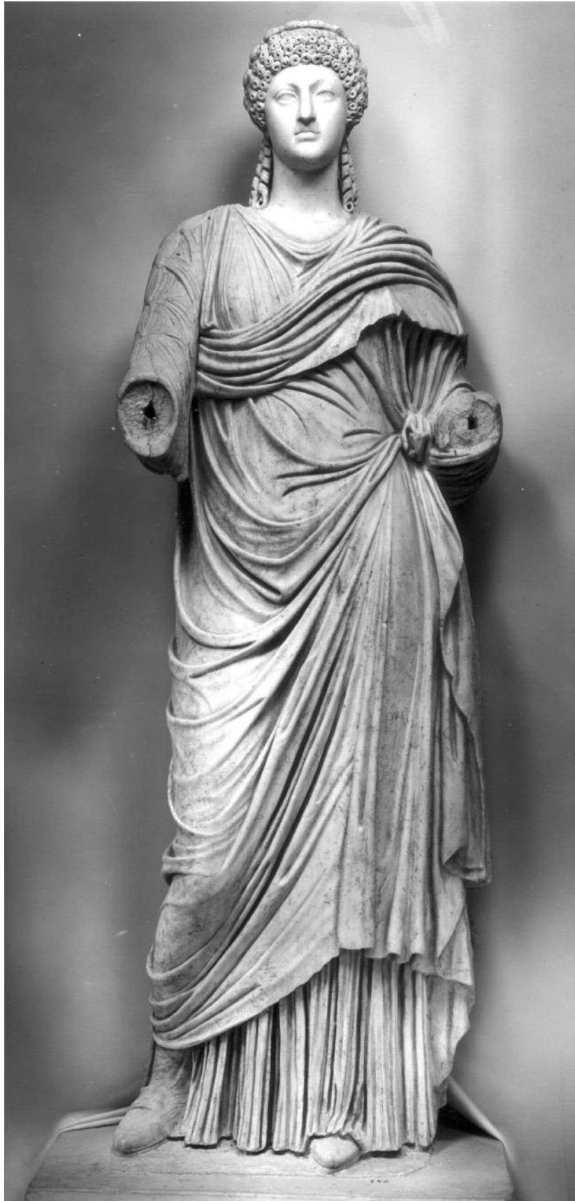
Fig. 1. Portrait statue of a priestess (?), so-called Poppaea Sabina, in Parian marble. From the Heraion of Olympia. Olympia Museum Λ 144.