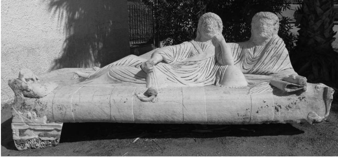
Fig. 4. Proconnesian sarcophagus lid. Hermione.

high classical type, which was occasionally used for imperial portraiture, and is highly idealized, perhaps implying heroization. 15 The inscribed base of an honorary statue of the 1st c. A.D. that stood next to it describes the honorand, Theon, as a hero. 16 A statue in Pentelic marble from Gytheion showing the deceased youth as Dionysos preserves all the trappings of that god: wreathed with ivy, he holds a kantharos in his right hand, resting his left hand on a vine, and is accompanied by a panther. 17 It dates from the 3rd c. A.D. and the body type derives from a Hellenistic prototype.