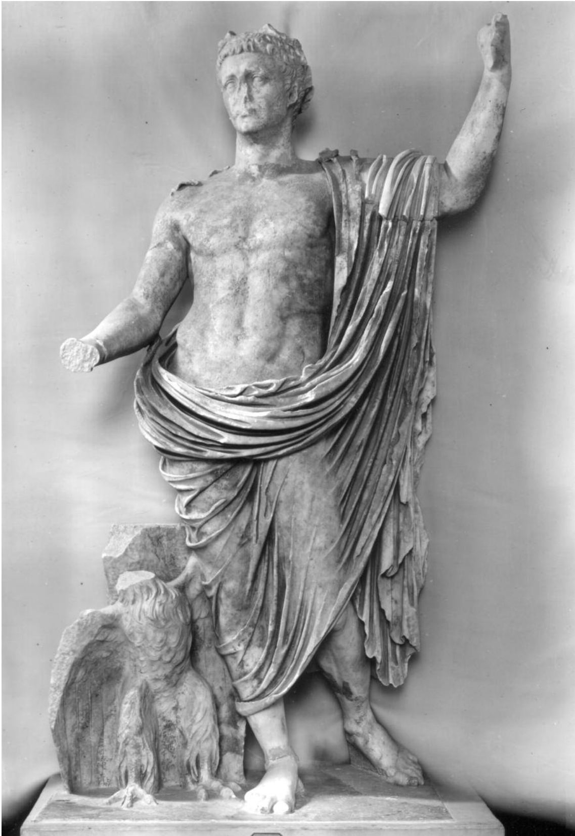
Fig. 6. Colossal portrait statue of Claudius in Pentelic marble, signed by the Athenian sculptors Philathenaios and Hegias. From the Metroon of Olympia. Olympia Museum A 125 (Photo: German Archaeological Institute, Athens, neg. no. OLYMPIA 2126).