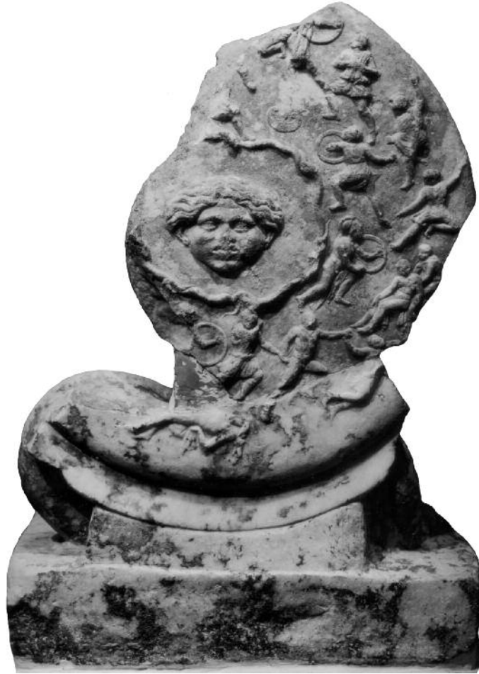
Fig. 8. Shield from a reduced copy of Pheidias' Athena Parthenos. From Patras. Patras Museum 6.