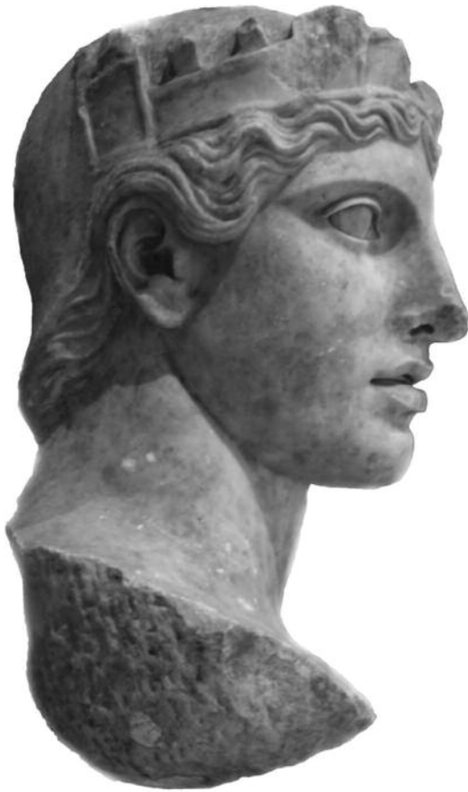
Fig. 10. Head of city goddess wearing helmet and mural crown, here identified with Roma as city goddess. Pentelic marble. From Sikyon. Sikyon Museum 324.