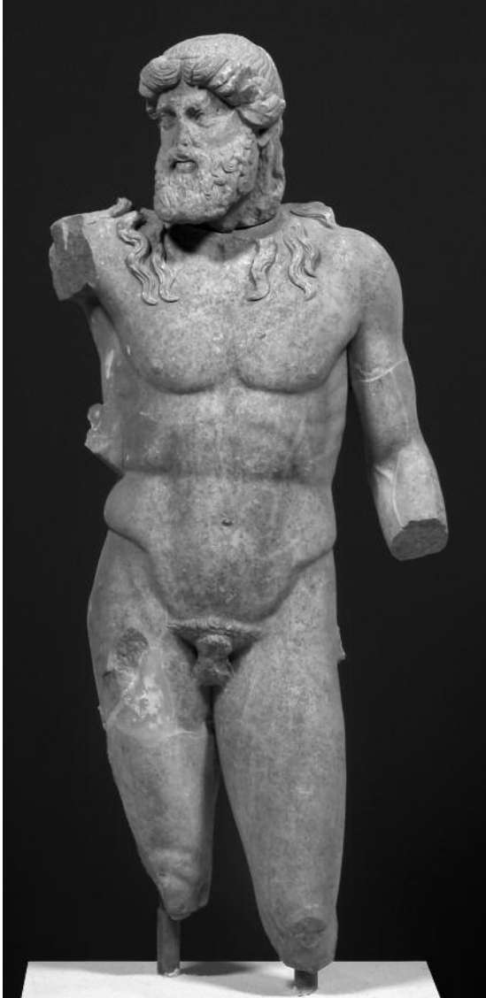
Fig. 7. Statue of Zeus in Pentelic marble. From the gymnasium of Olympia, attributed to the Nymphaion of Herodes Atticus. Olympia Museum Λ 170.

of the Gods that stood in Athens. 44 Amphitrite's statue base carried relief narratives inspired by creations of Pheidias and his pupils: the slaughter of the Niobids is dependent on the armrests of the throne of Pheidias' Zeus at Olympia, while the Callydonian boar hunt may document an otherwise unknown classical prototype. 45 The Isthmia group is attributed to an Athenian workshop. Pausanias (II. 1, 8) describes another cult-stature group set up by Herodes Atticus and therefore only a few decades later than the extant marble group: it was made of ivory and gold and stood on a base with a different relief narrative. We do not know the size of Herodes' group but it need not have been colossal. It is likely that both groups stood in the cella of Poseidon's temple. 46