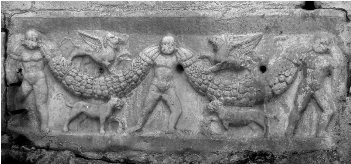
Fig. 3. Laconian sarcophagus in Taygetos marble. Mistras, embedded in Ottoman fountain adjacent to Panagia ton Boubalon church.

imperial period. The Argive and Sicyonian Schools of the classical and Hellenistic periods were now defunct and Pentelic marble dominated the markets. Quantities of Attic sarcophagi were imported into the Peloponnese or served as models for local imitations. 8 Imitations of Attic and other sarcophagi in Laconia and Arcadia, for example, are easily distinguished by the use of local marble, from Mt. Taygetos in Laconia ( Fig. 3 ) and from Doliana in Tegea. 9 Asiatic sarcophagi were also imported, for example in Patras, Sparta and Hermione ( Fig. 4 ) but they are few and far between. 10