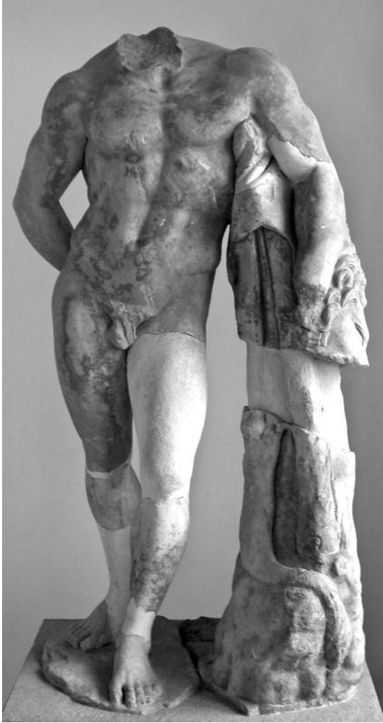
Fig. 9. Copy of Lysippos' Herakles Farnese. From Argos. Argos Museum.

ing a mural crown and holding a cornucopia is shown on Roman imperials issued in Sikyon under Plautilla. 55 The representation of Roma as a city goddess wearing a mural crown as attested by the head in Fig. 10 is a new invention and was probably related to the imperial cult as was customary with most cults of Roma in Greece. 56