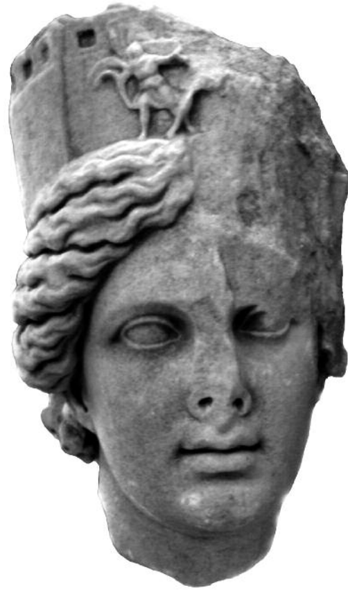
Fig. 11. Head of city goddess wearing mural crown with figural scene, here identified with the Tyche of Sparta. Pentelic marble. From Sparta. Sparta Museum 7945.

as regards architectural sculptures, imperial portraiture or new personifications. The Peloponnese can boast of at least one outstanding villa with a magnificent sculpture collection which was evidently assembled in Attica and elsewhere. The region was dominated by Athenian artists and materials but local works were also produced, especially in more isolated parts like Laconia which also produced its own marble.